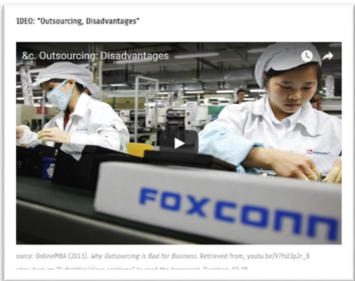
Video 2: “Outsourcing, Disadvantages”